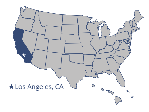
Housing: Homestay and on-campus residences for grades 8–12. Students in grade K-7 may enroll if they reside with a parent or relative in the local area.

Located in the northern edge of Los Angeles, international students appreciate the School's beautiful campus and surroundings, the safe neighborhoods where the campus is situated, and easy access to Los Angeles International Airport for trips home and back. A well-established homestay program is managed by a highly experienced International Program Director. Homestay families are interviewed extensively prior to selection and pairing with international students.